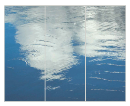
Nature Wall Panel Design