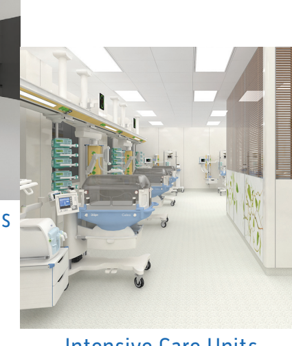
Intensive Care Units