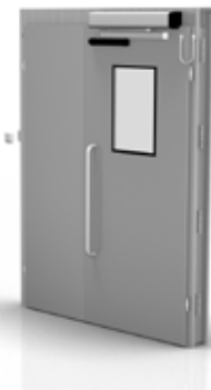
Double Asymmetric Hinged