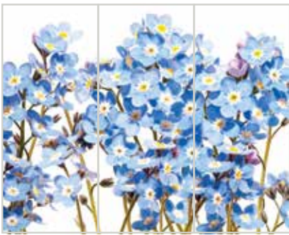
Floral Wall Panel Design