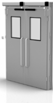
Double Symmetric Hinged