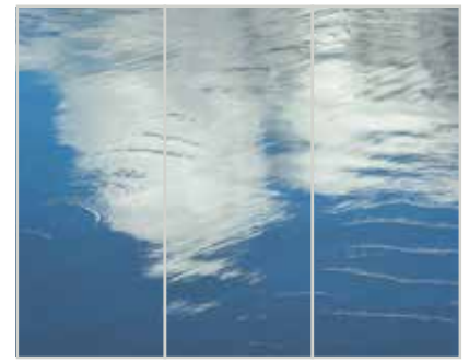
Nature Wall Panel Design